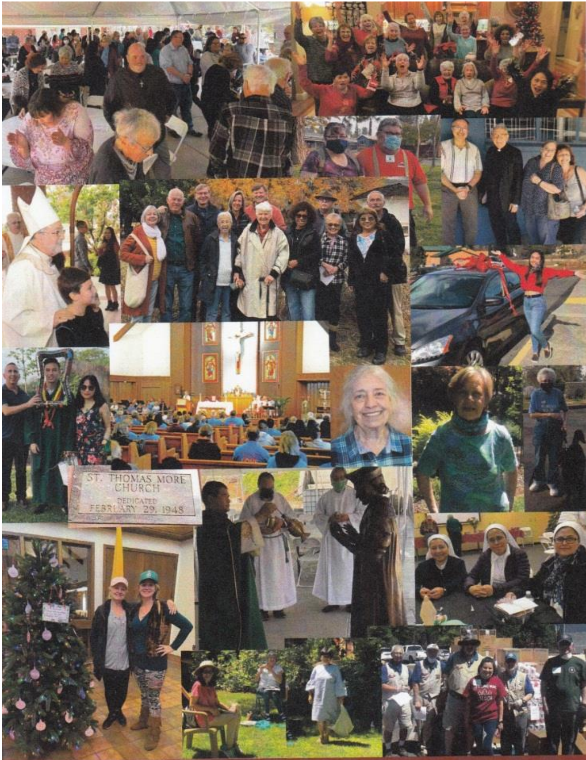
I sought the Lord, and he answered me and delivered me from all my fears. -Psalm 34:5